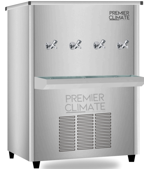
MODEL - PC100T4