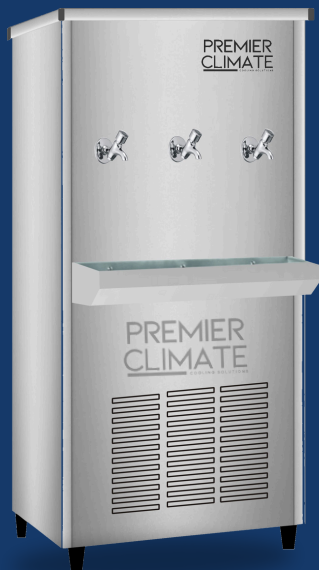
MODEL - PC45T3