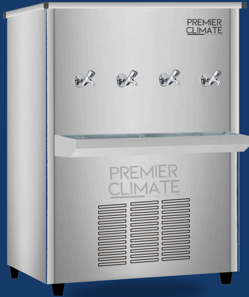
MODEL - PC85T4