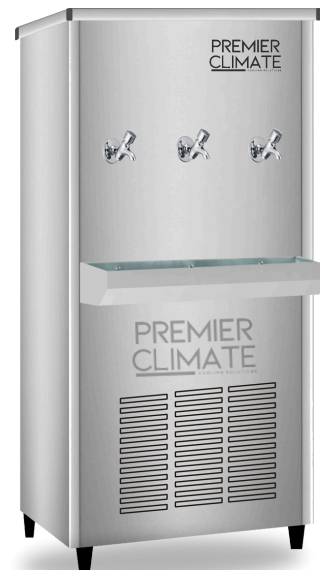
MODEL - PC65T3